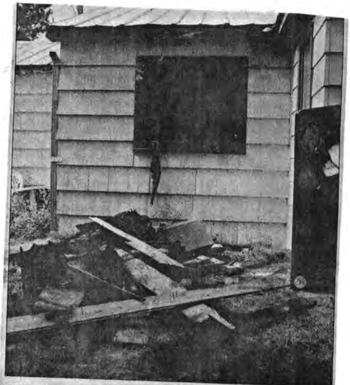
DEBRIS FROM the fire that apparently killed a man Saturday morning smolders outside the home on Rose Crossing.